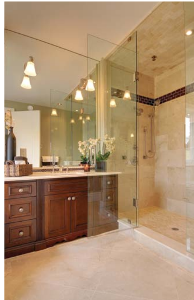
LEFT: A whirlpool tub provides the perfect escape after a busy day. TOP LEFT: An outdoor fireplace is a great space to enjoy a glass of wine. TOP RIGHT: An elegant chandelier hangs above the king-size master bed. ABOVE: An en suite features a large walk-in glass shower and heated floors.