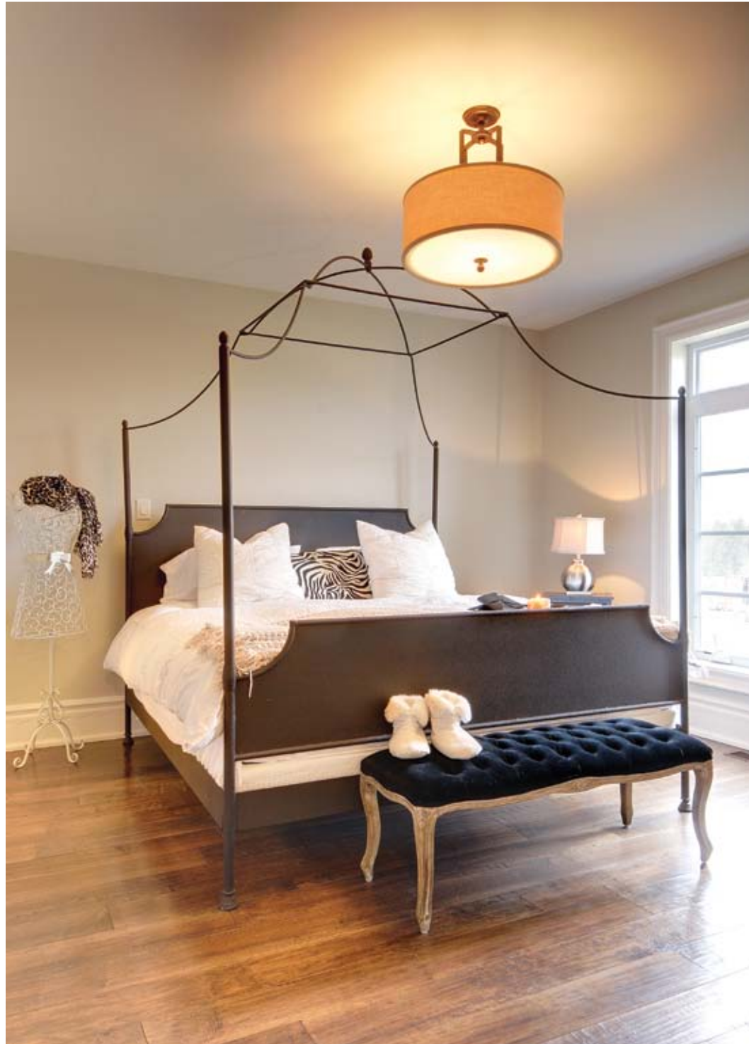
RIGHT: Hardwood floors are found throughout the home, including in the bedrooms. BELOW: A sassy shoe chair is the right fit for getting ready in the morning.