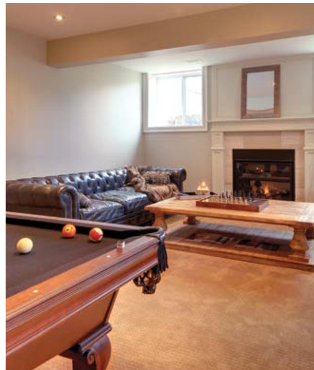
ABOVE: The home theatre features comfy leather chairs and deep wood panelling for an old-world cinema experience. RIGHT: The games room is a great place to unwind with a regulation-size pool table and warm fireplace.

"It is so important that the homeowners are just as comfortable with us as we are with them," she says. OH