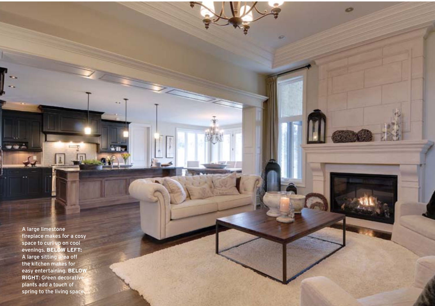
A large limestone fireplace makes for a cozy space to curl up on cool evenings. BELOW LEFT: A large sitting area off the kitchen makes for easy entertaining. BELOW RIGHT: Green decorative plants add a touch of spring to the living space.