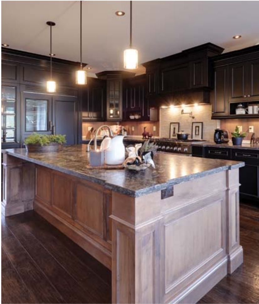
ABOVE: A leathered-finish granite countertop creates a beautiful and functional workspace in the kitchen. TOP RIGHT: The large laundry room is filled with exceptional storage space. RIGHT: Stainless steel appliances create a chef's paradise in the kitchen. FAR RIGHT: The open kitchen space features a built-in fridge, wine rack and ample counter space.