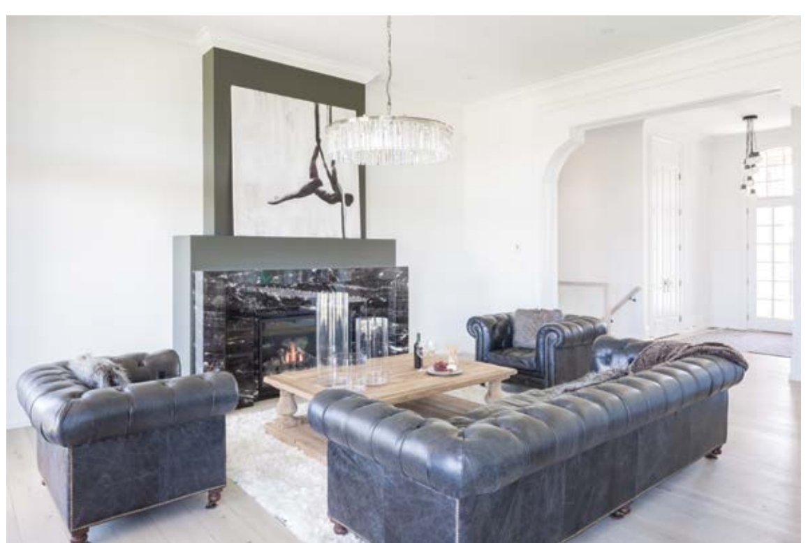
LEFT: The dark accent behind the fireplace surround in the great room is the only spot upstairs painted anything but white. BELOW: The fireplace beckons everyone in autumn – big and small.